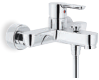
AB87110/1CR External single control mixer tap