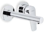
WE00198, SY97199CR Wall-mounted single control mixer tap with 150 mm spout