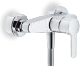
AB87130CR External single control mixer tap