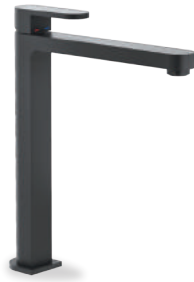
UP94128/2BM Single control washbowl mixer tap