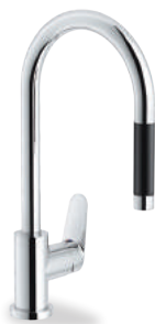
BS101137/1CR Single control mixer tap, swivel spout, pull-out single jet hand shower