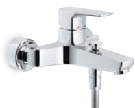
W103110/1CR External single control mixer tap