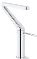
ZM00113/1CR Energy saving single control mixer tap, 360° swivel body and spout