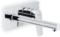
WE00198CR, SY97198/1CR Wall-mounted single control mixer tap with 200 mm spout