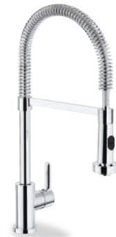
AB87300/3CR Single control mixer tap with swivelling spout and two-jet directional shower head