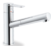
SA99117CR Single control mixer tap, swivel body, pull-out single jet hand shower