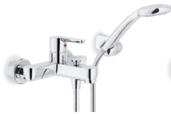
AB87110CR External single control mixer tap with duplex