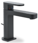
UP94118/1BM Single control mixer tap