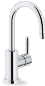
AB87338/2CR Single control mixer tap