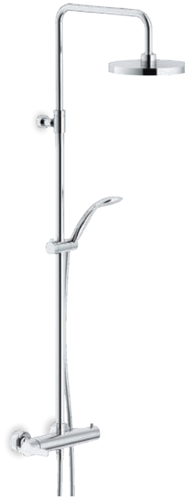
AB87130/50CR External single control mixer with telescopic rail, swivel shower head ø 200 mm with rain jet, single jet shower head