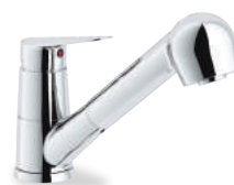
BS101127CR Single control mixer tap, swivel body, pull-out 2-jet hand shower