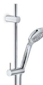
AD140/23CR 650 mm wall rail with single jet shower head