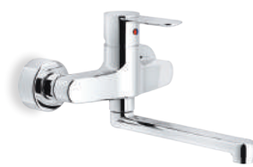
SA99115CR External set, swivel spout