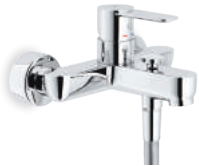
SA99110/1CR External single control mixer tap