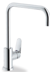
BS101134CR Single control mixer tap, swivel spout