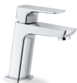
W103118/1CR Single control mixer tap