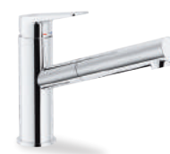
SY97117CR Single control mixer tap with swivelling body and single jet pull-out shower head