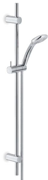
AD140/39CR 650 mm wall rail with single jet shower head