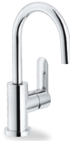
SA99338/2CR Single control mixer tap