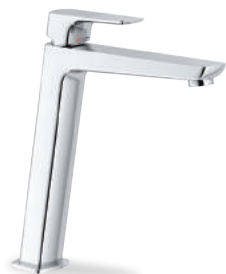
W103128/2CR Single control washbowl mixer tap