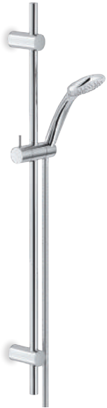
AD140/39CR 650 mm wall rail with single jet shower head