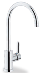
AB87133CR Single control mixer tap with swivelling spout