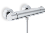
SY97030CR External thermostatic mixer tap