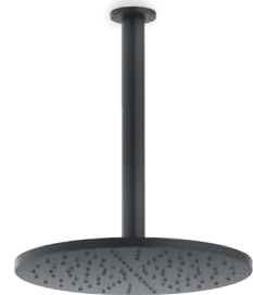
AD138/64BM, AD139/113BM 350 mm ceiling arm, swivel shower head ø 300 mm with rain jet