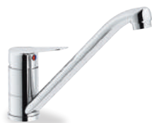
BS101113/60CR Single control mixer tap, swivel spout