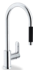
SA99137/1CR Single control mixer tap, swivel spout, pull-out single jet hand shower