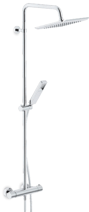
W103030/31CR External single control mixer, swivel shower head 245 x 245 mm with rain jet, single jet shower head