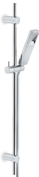
AD140/49CR 650 mm wall rail with single jet shower head