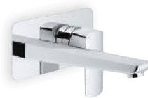
WE00198CR, W103198/1CR Wall-mounted single control mixer tap with 200 mm spout