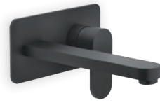
WE00198BM, UP94198/1BM Wall-mounted single control mixer tap with 200 mm spout