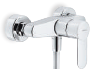
SA99130CR External single control mixer tap