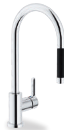
AB87137/1CR Single control mixer tap with swivelling spout and single-jet pull-out shower head