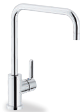
AB87134CR Single control mixer tap with swivelling spout