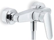
BS101130CR External single control mixer tap