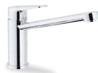
SY97113/25CR Single control mixer tap with 360° swivelling body