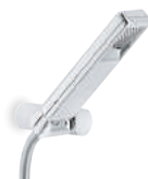
AD146/25CR Directional support with single jet shower head