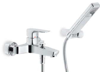
W103110CR External single control mixer tap with duplex