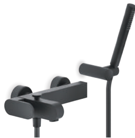
UP94110CR External single control mixer tap with duplex