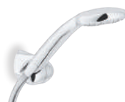
AD144/4CR Directional support with single jet shower head