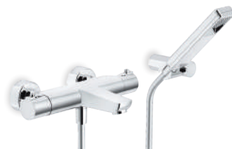
W103010/1CR External thermostatic mixer tap with duplex