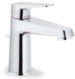
SY97116/1CR Single control mixer tap