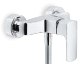
W103130CR External single control mixer tap