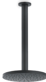
AD138/64BM, AD139/112BM 350 mm ceiling arm, swivel shower head ø 200 mm with rain jet