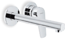
WE00198, SY97199/1CR Wall-mounted single control mixer tap with 200 mm spout