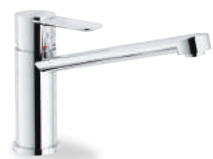
SA99113/25CR Single control mixer tap, 360° swivel body