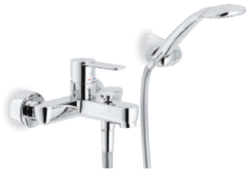
SA99110CR External single control mixer tap with duplex