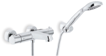
SY97010CR External thermostatic mixer tap with duplex