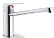
BS101113/25CR Single control mixer tap, 360° swivel body