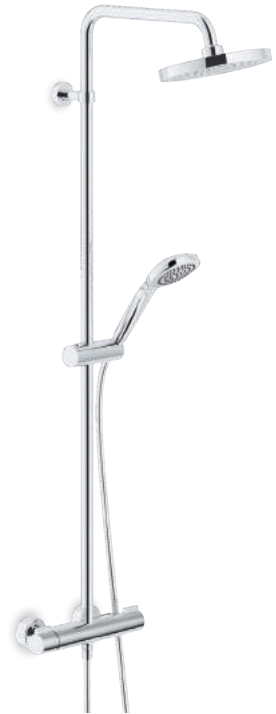
AB87030/30CR External thermostatic mixer, swivel shower head ø 200 mm with rain jet, single jet shower head