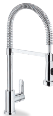
SA99300/3CR Single control mixer tap, swivel spout, adjustable 2-jet hand shower