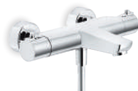
W103010/1CR External thermostatic mixer tap