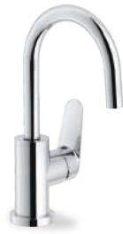
BS101338/2CR Single control mixer tap