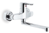
AB87115CR External set, swivel spout