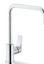
SY97134CR Single control mixer tap with swivelling spout