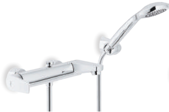
SY97110CR External single control mixer tap with duplex