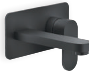
WE00198BM, UP94198BM Wall-mounted single control mixer tap with 150 mm spout