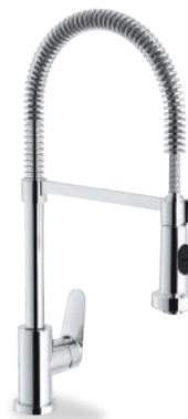
BS101300/3CR Single control mixer tap, swivel spout, adjustable 2-jet hand shower