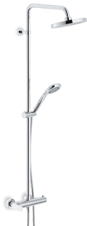
SY97130/30CR External single control mixer, swivel shower head ø 200 mm with rain jet, single jet shower head