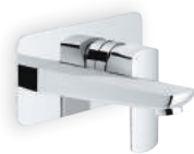
WE00198CR, W103198CR Wall-mounted single control mixer tap with 150 mm spout