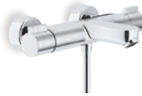
AB87010/1CR External thermostatic mixer tap