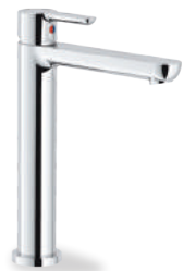
AB87713CR Single control mixer tap with swivelling body