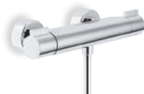
AB87030CR External thermostatic mixer tap