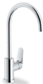
BS101133CR Single control mixer tap, swivel spout