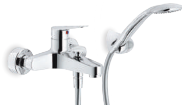
BS101110CR External single control mixer tap with duplex