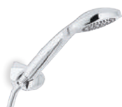
AD146/18CR Directional support with single jet shower head