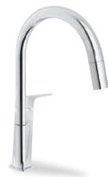
W103127CR Single control mixer tap with swivelling body and two-jet pull-out shower head