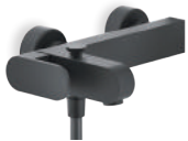
UP94110/1CR External single control mixer tap