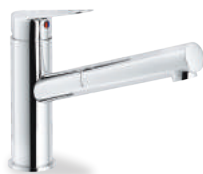
BS101117CR Single control mixer tap, swivel body, pull-out single jet hand shower