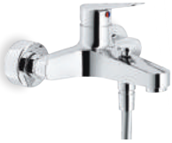
BS101110/1CR External single control mixer tap