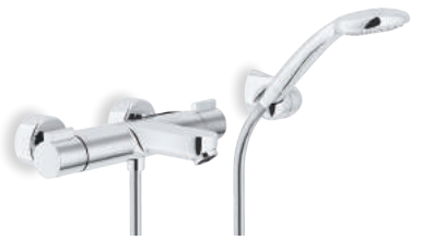
AB87010CR External thermostatic mixer tap with duplex