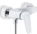
SY97130CR External single control mixer tap